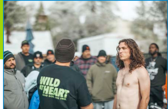
Men took their commitment to Christ to the next level and were baptized, despite the VERY cold weather at Angeles Crest.

Despite the limitations of the pandemic and by the grace of God, Angeles Crest safely and carefully served a few groups in 2020.